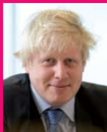
Mayor of London, Boris Johnson

I would like to wish everyone a happy and prosperous Diwali.